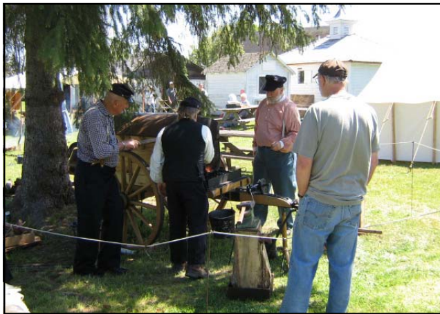
Living history, Encampment at the museum