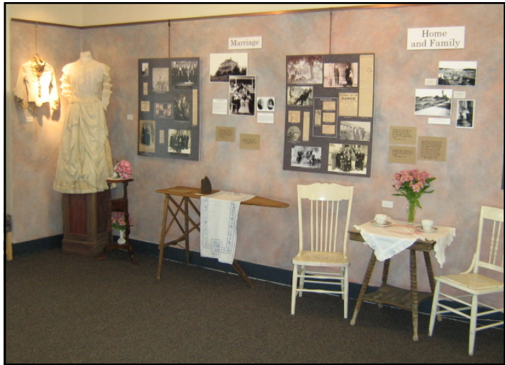
Our Town exhibit at San Juan Community Theatre