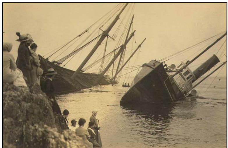
The America (left) and the Lorne.

The America was a three-masted full-rigged Down Easter built in Quincy, Massachusetts in 1874. The America hauled cargo from New York and Boston to the Far East until purchased by the James Griffiths Company in 1906. The ship was converted to a barge and plied the waters of Puget Sound until that fateful day in 1914. The vessel was loaded with a shipment of coal and was being towed by the tug Lorne , when it hit the rocks and eventually sank. The Lorne was later salvaged.