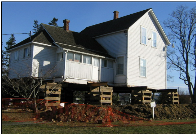
King house awaiting a new foundation