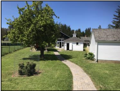
Take a stroll on our lovely grounds...