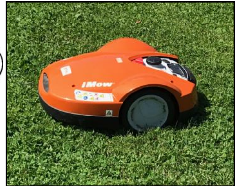
...and meet "Chopper" or the iMow our robotic lawnmower, a recent donation.