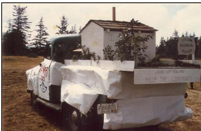
County Fair Parade entry 1966. A model of the farmhouse mounted on a pickup seeking members and donations. Some things never change!

As we look forward to the next 50 years, we need your help to record and preserve the history of San Juan Island for generations to come. Your continued financial and volunteer support will aid in our growth and development and allow us to keep a great thing going. Thank you.