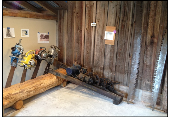
The logging wing features the evolution of saws used in logging: the two-man saw or "miserly whip," a drag saw and a collection of early chain saws from the 1950's.

We thank all the individuals, contractors and suppliers for their financial donations and discounts/donations of time and materials towards the MHI. All the support is very much appreciated.