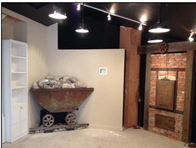
The lime wing features an authentic quarry cart from Roche Harbor and replica lime kiln, made with bricks from the original kilns.

See page 3, the MHI in pictures for more