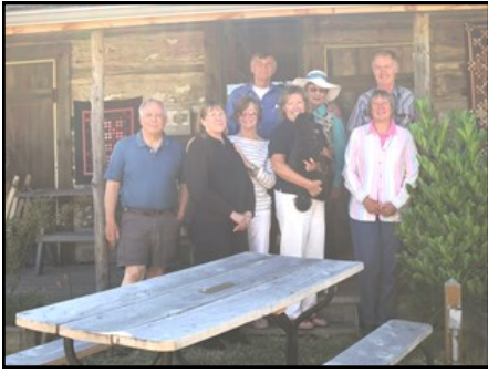
FH Grange #225 members

If you happened to attend the Pig War Picnic and Music on the Lawn, you may have noticed the new picnic tables on the museum grounds. The tables were provided through the volunteer work of the Friday Harbor Grange #225. The tables are a wonderful addition to the museum grounds and have been getting a lot of use.