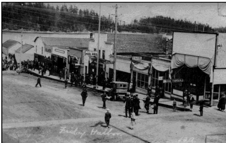
A recent addition to the photo archives which shows an early street scene on lower Spring Street in Friday Harbor. Date unknown.