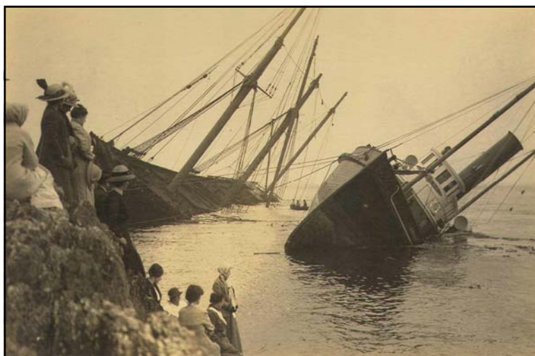
The America (left) and the Lorne.

The America was a three-masted full-rigged Down Easter built in Quincy, Massachusetts in 1874. The America hauled cargo from New York and Boston to the Far East until purchased by the James Griffiths Company in 1906. The ship was converted to a barge and plied the waters of Puget Sound until that fateful day in 1914. The vessel was loaded with a shipment of coal and was being towed by the tug Lorne , when it hit the rocks and eventually sank. The Lorne was later salvaged.